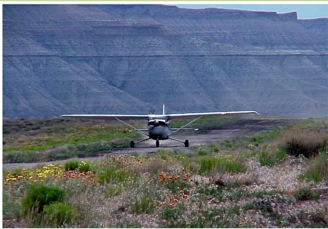
Arriving at Sandwash landing strip with wildflowers in bloom.