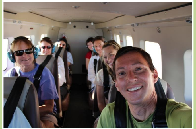
On board the airplane getting ready to take off.