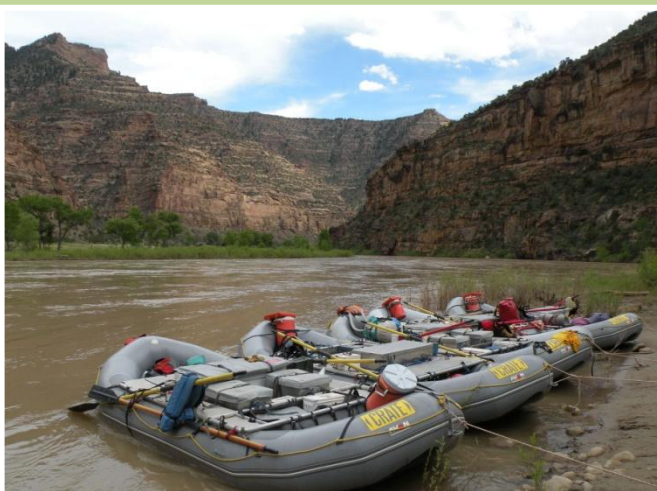
18-Foot Avon Pro rafts with self-bailing floors provide transportation down the river.

From the landing strip, it's a mile, or so, walk down to the river, where the rafts are waiting. Gear is transported by truck. It's a good chance to stretch your legs before starting down the river.