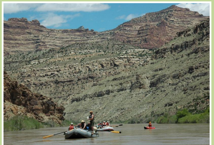
The first day on the river is mainly calm water, so it's a good opportunity to get used to the rafts and to practice in the duckies.