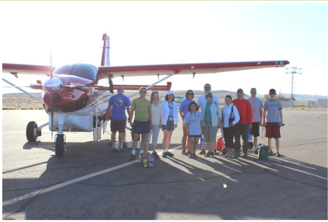
Leaving Green River for scenic flight to Sandwash.