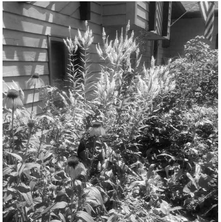
In the front of the house, a Swallowtail alights on a Purple Coneflower, with Culver's Root behind.