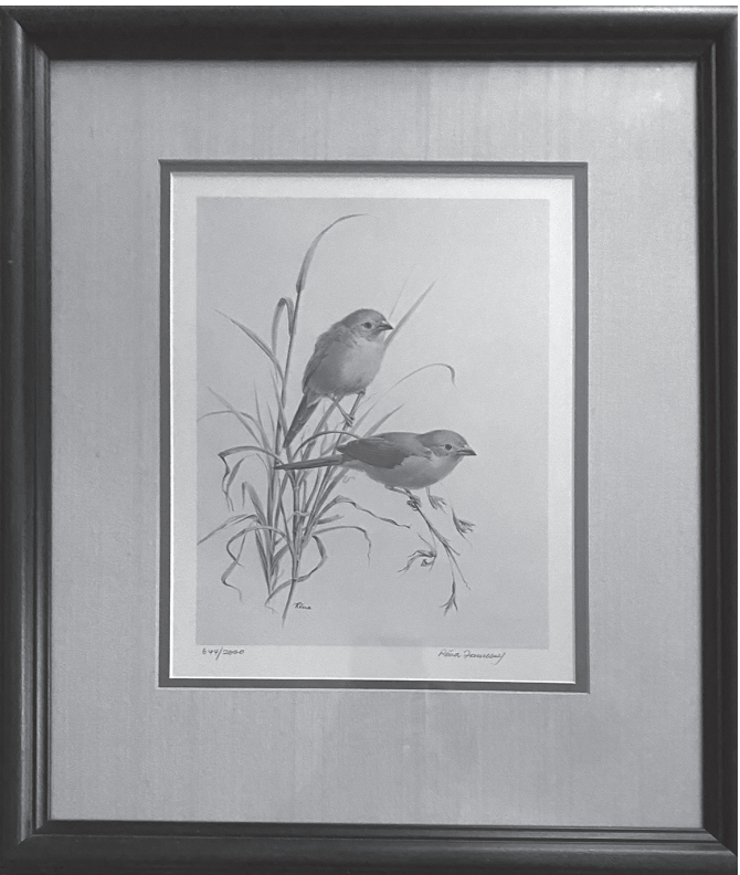
African Birds by Rena Fennessy Framed and matted • 16 x 20 • 644/2000