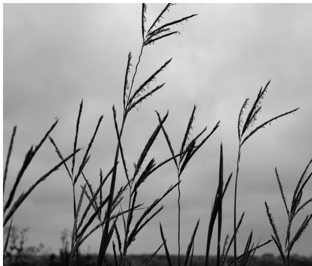
Prairie grass – Big bluestem