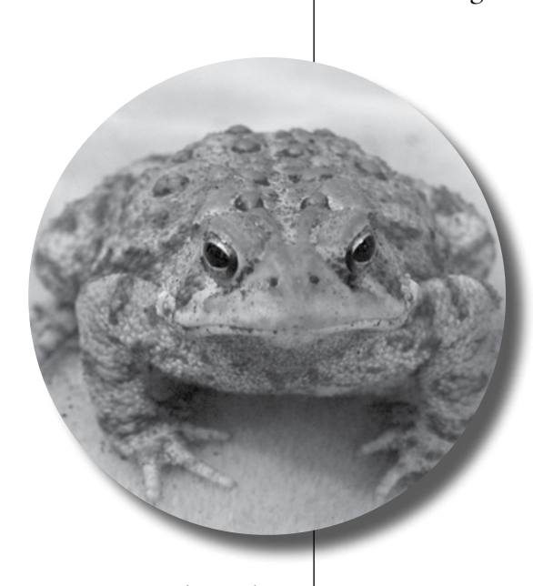
Visit Us On the Web www.fdlaudubon.org

*October's program will be on Thursday, instead of Wednesday.