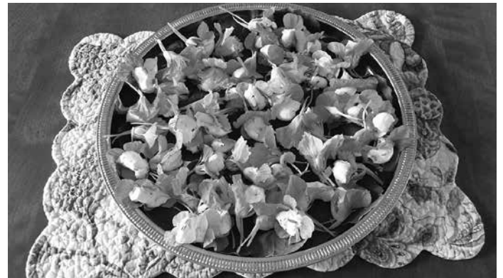
Stuffed Nasturtiums by KathyWaldschmidt

The annual Wild Feast Potluck will be held on September 5 at the DeNevue Creek Shelter at Lakeside Park. This is a reminder to plan ahead with wild ingredients when they are available. Some items can be frozen or preserved for later use. More details will follow in the fall newsletter.