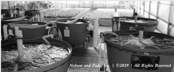
Nelson and Pade, Inc. | ©2019 | All Rights Reserved

At Nelson and Pade Aquaponics, see how fish and plants are grown together in one integrated, soil-less, commercial, sustainable, year-round farming system. Unlike traditional agriculture, they use one-sixth of the water to sustainably grow eight times more food per acre, without the use of pesticides, herbicides or chemical fertilizers, year round, in any climate. $10/person. Each participant will receive a free head of fresh lettuce. For those carpooling, we will leave the southwest corner of Menards parking lot at 11:30 am. Tour starts at 1 pm for those wanting to meet there.